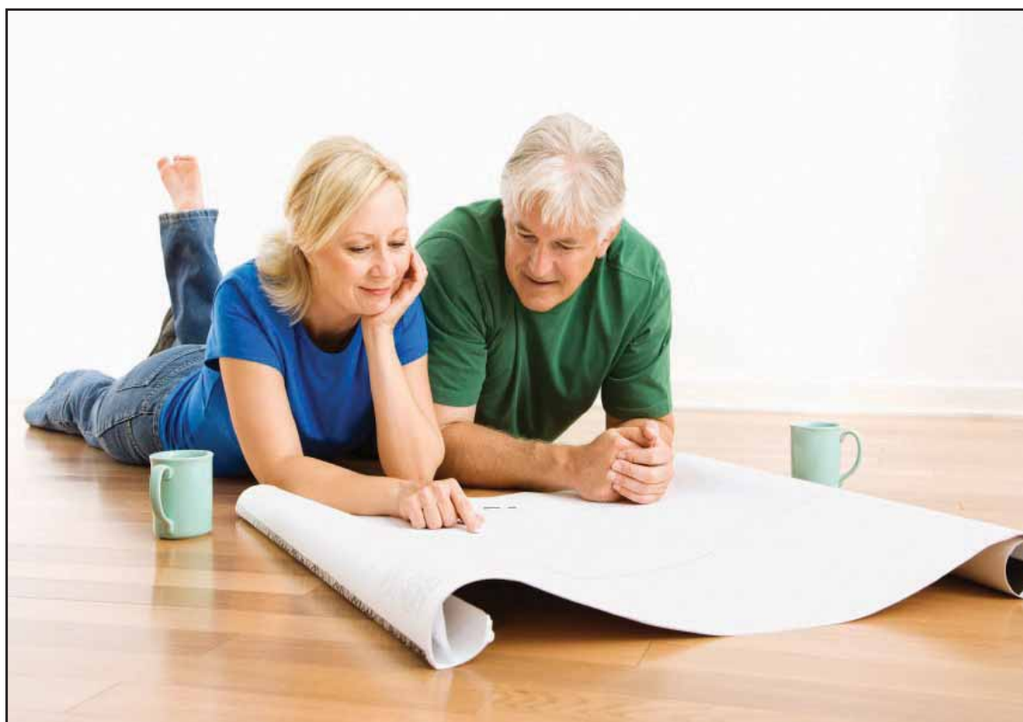
As the baby boomer generation reaches retirement, they often find themselves planning renovations to their homes that will allow them to "age-in-place" in comfort and safety.

Who can you rely on to modify your home? Builders