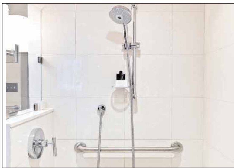
A walk-in shower with grab bars provide safety and security for aging homeowners.

tions. The NAHB Remodelers, along with its Research Center, Seniors Housing Council and the AARP, developed the CAPS program to address the growing number of consumers who will soon require these modifications.